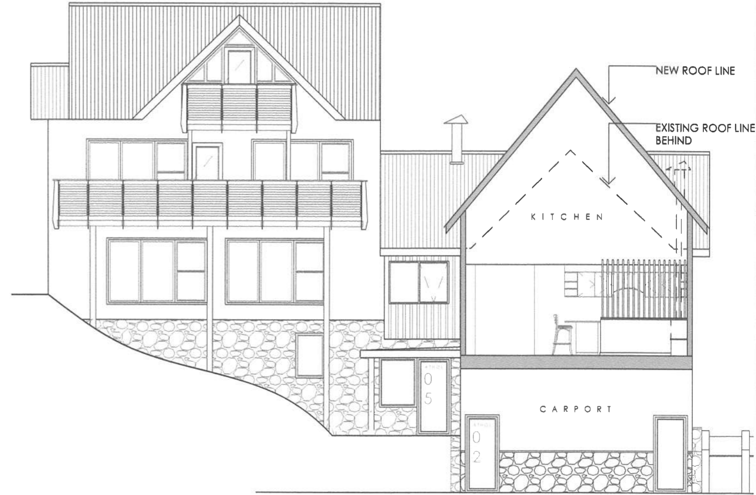
SECTION B - B